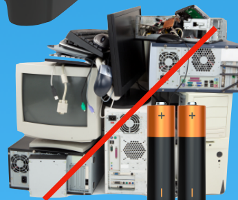
NO E-WASTE OR BATTERIES