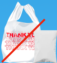
NO PLASTIC BAGS OR PACKAGING