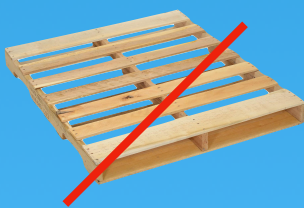
NO WOOD PALLET