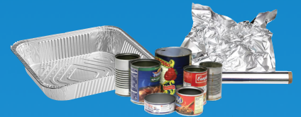
METAL ALUMINUM, STEEL AND FOIL