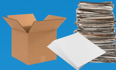
PAPER, CARDBOARD, MAGAZINES