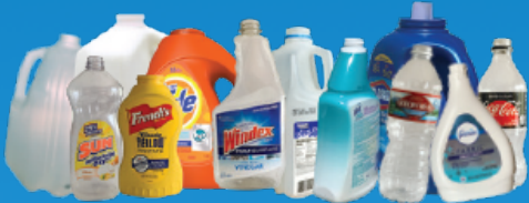
PLASTICS #1, 2, 5 BOTTLES, JUGS AND JARS